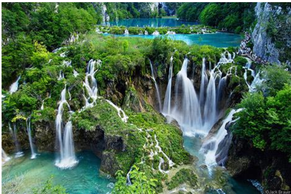
Croatian Nacional park Plitvice lakes